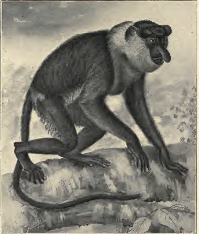
FIG. LXXXIX. NASALIS LARVATUS. PROBOSCIS MONKEY.